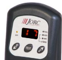
Visual display of current operating cycle