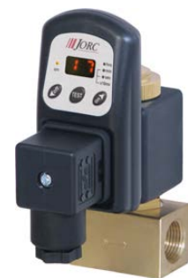
Also available in a FLUIDRAIN valve version