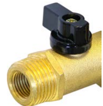
Dual inlet feature 1/2" & 1/4"